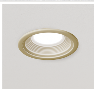
BEFORE Existing 6" Fixture