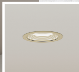
BEFORE Existing Fixture