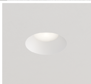
AFTER 4" Flangeless Trim