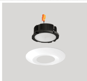
4" Downlight + Surface Trim